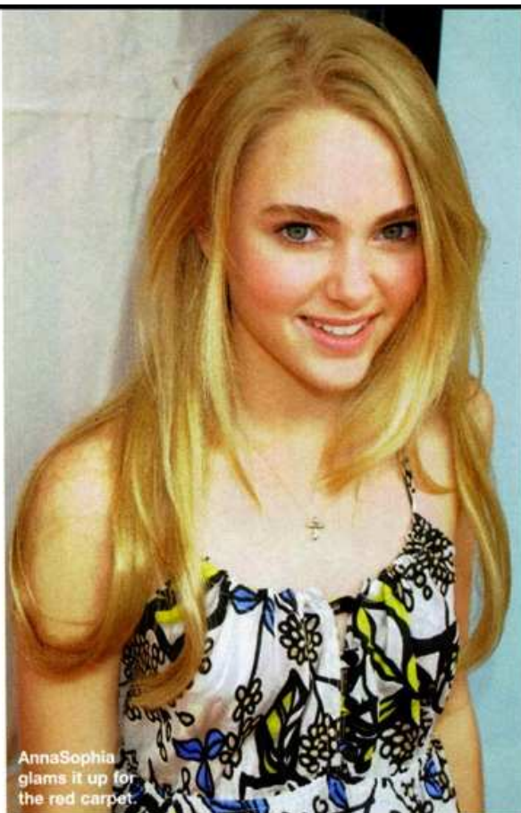
AnnaSophia glams it up for the red carpet.

More often than not, though, it seems AnnaSophia is doing something right. Her second trip to L.A., she auditioned for and was offered the lead role of Opal in Because of Winn-Dixie . And her career has just taken off from there. It's no exaggeration to say that lately her successes have been big—literally. "I remember seeing this huge billboard for Charlie and the Chocolate Factory . It was on the side of a building and I couldn't believe how enormous it was," she says. "Then, the first time I saw the Race to Witch Mountain one, we were driving up some highway and all of a sudden we saw it. I was like, 'Look,